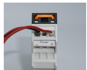
Fig. 4 Power supply terminal ←