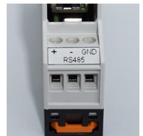
Fig. 2 RS485 connector ←

If you use the serial port to read data from ModBus RTU devices, connect the RS485 wires as shown in Fig.2.