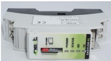
→ Fig.1 SD card insertion

EasyLogXL stores the data in a standard "SD card". Insert the SD card with the connectors face toward the silk-screen printed part, as shown in Fig.1. The connector is a push-push type: to insert the card, press it until a click is felt. To remove the SD card, press lightly; by clicking, the card will lift a bit and it can be withdrawn. We always recommend the use of industrial-grade SD cards.