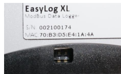
Fig. 6 Example DIP-SWITCH OFF OFF position